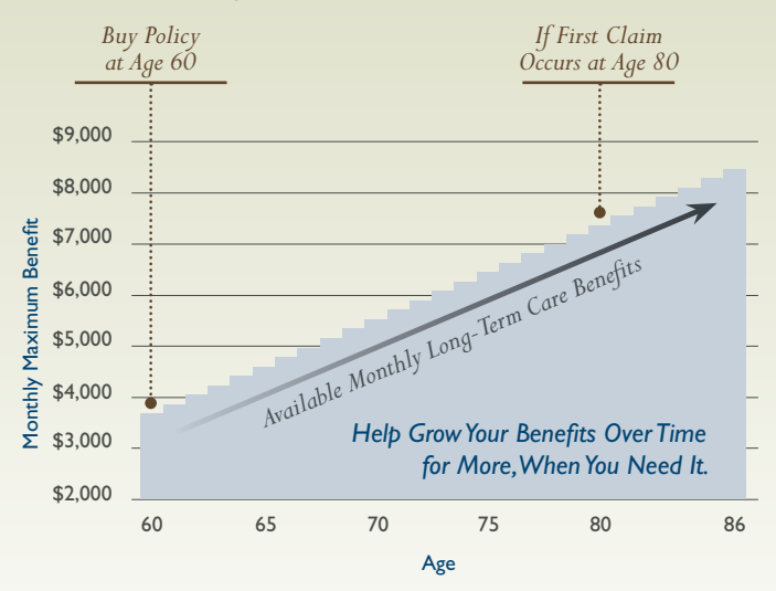
Hypothetical example based on married, nonsmoking female, issue age 60, with $100,000 one-time premium, 7-year benefit duration, and 5% Simple Inflation Benefit elected. The elected maximum benefit period would be for 84 months and the monthly maximum benefit would rise to $7,302 if the first claim began at age 80. The monthly amount reimbursed is the cost of covered long-term care expenses actually incurred, which may be less than the Monthly Maximum Benefit.

By electing an Inflation Benefit Option of 5% Compound, 5% Simple, or 3% Simple Interest, your monthly long-term care benefits will automatically increase every year. This can help your benefit dollars grow along with the rising costs of inflation and long-term care.